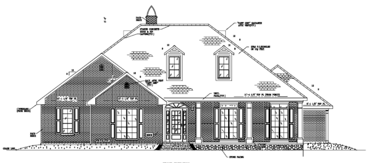
FRONT ELEVATION SCHE: 1/4'-0'-0'